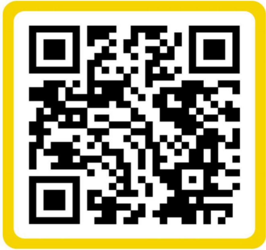
After Breakout Session Survey