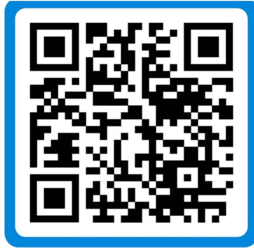
After Forum Survey